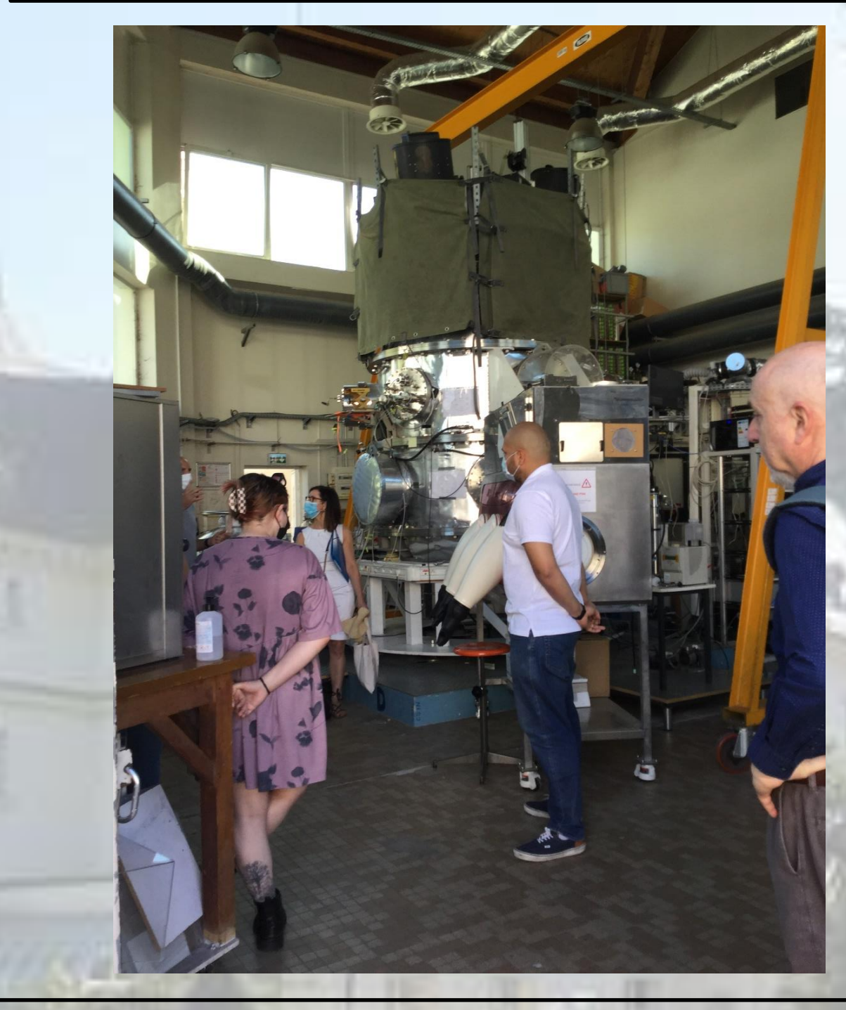
Arrival of the group to the Domaine de Fremigny (Wednesday 6 July 2022)